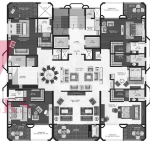
1st, 3rd, 5th & 9th Floor